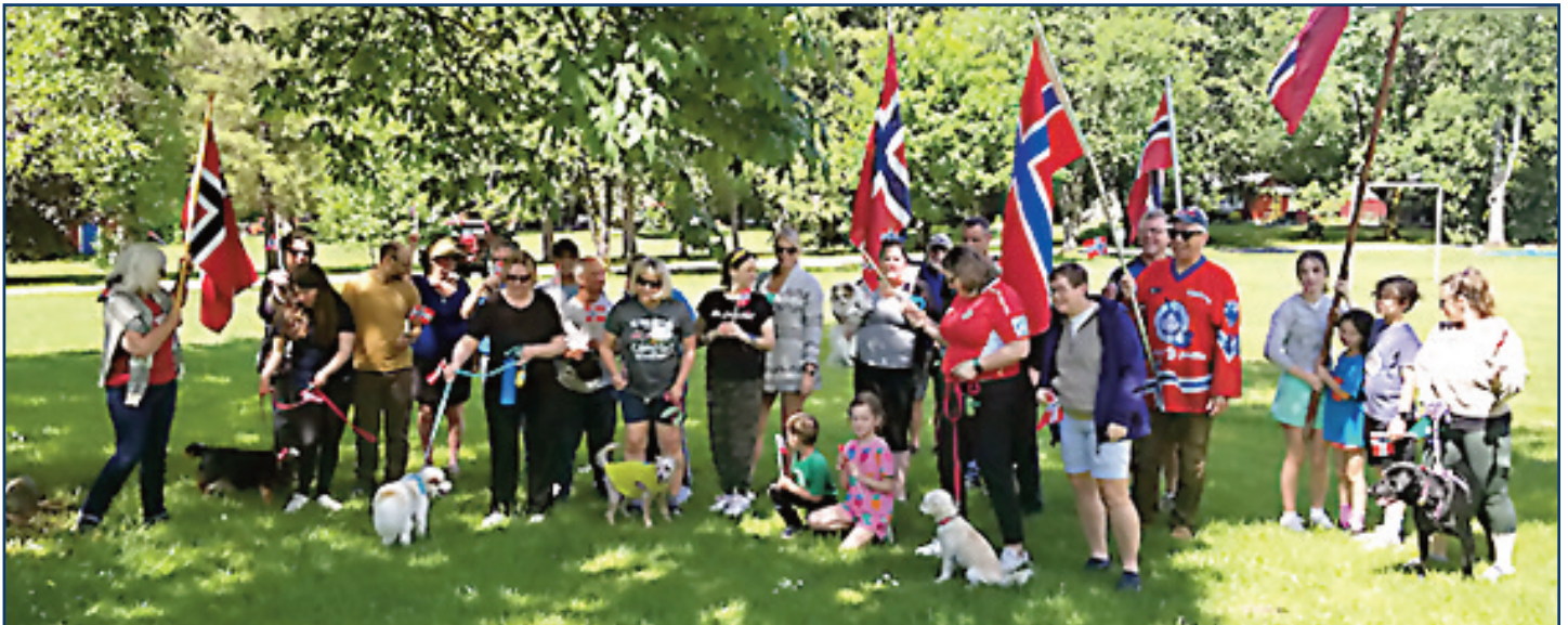
Sleipner Lodge had a very enthusiastic 17 Mai Parade at Hatzic Park