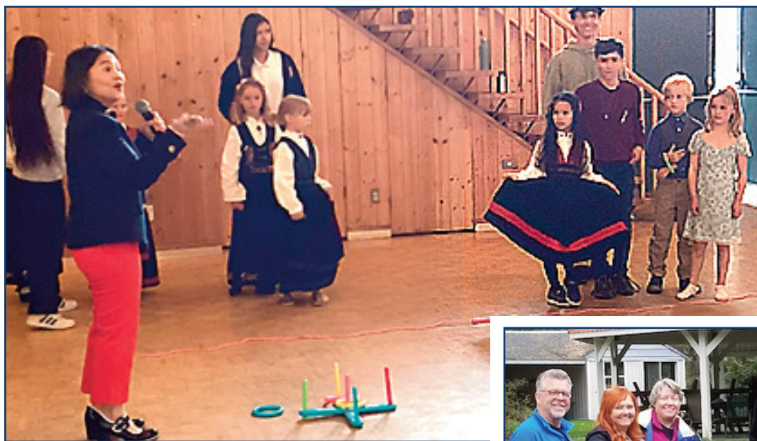
Children playing games at Valhalla's May 17th celebration.

for everyone, the participants and those cheering them on.