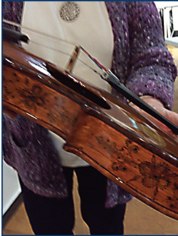
Viking Original Rosemalings on Lande Violin

thing that is important to all of District 7. But the most important event for all the