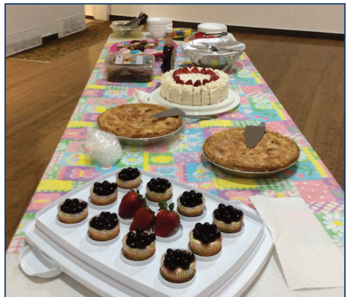
Viking lodge Dessert Table at Viking Lodge April Meeting