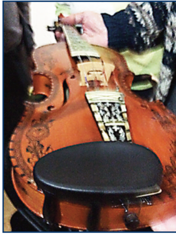
Left, 125 yr. old violin which originally belonged to Gordon's grandfather

lovely "hot lunch" potluck along with many wonderful desserts including a Riskrem pudding with an almond hidden in it! There were several door prizes given out and a 50/50 draw which always is fun.