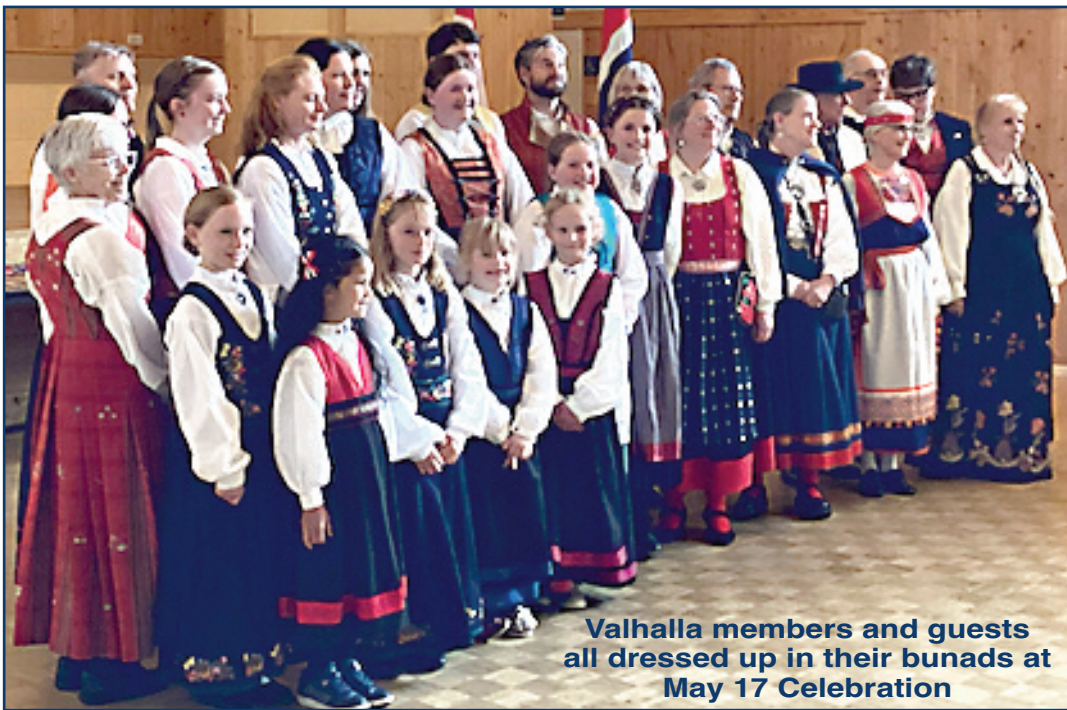
Valhalla members and guests all dressed up in their bunads at May 17 Celebration

house where park issues were discussed. Some items which were on the agenda.