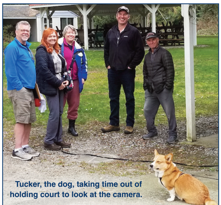
Tucker, the dog, taking time out of holding court to look at the camera.

We had a very successful Easter Egg Hunt. We held a Leaseholder's meet at the club-